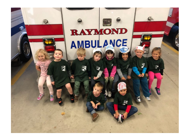
Preschool students visiting Raymond Fire Department