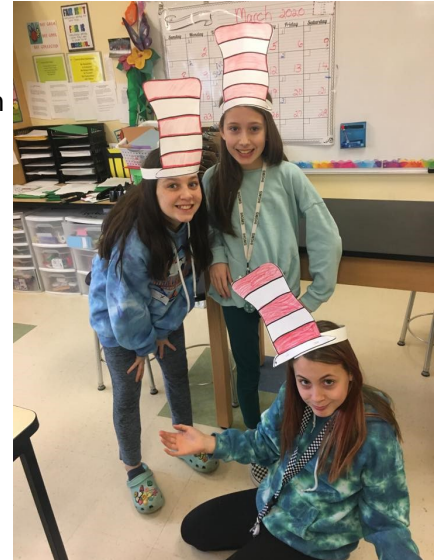
Read Across America Week