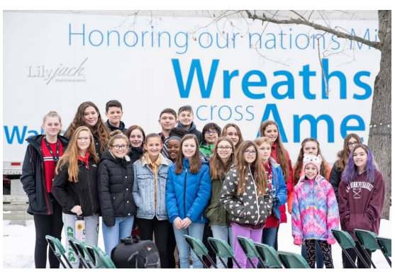
IHGMS students at Wreaths Across America