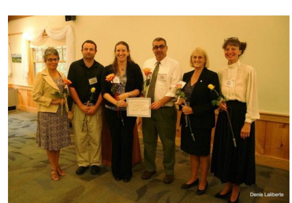
FEAT – Parent Involvement Award