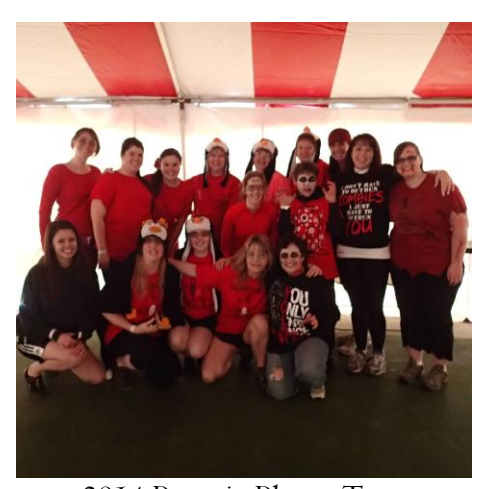
2014 Penguin Plunge Team

intensive interventions for our most at risk students. The Iber Holmes Gove Middle School further supports this initiative with the addition of academic intervention blocks. The Lamprey River Elementary School continues to refine and upgrade our behavioral intervention strategies. At Raymond High School, we have identified model reading interventions and are exploring ways to increase the amount of time for math intervention.