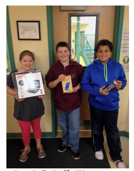
Ram Rally Raffle Winners

The focus of our work at IHGMS continues to be on the improvement of student performance. The primary areas of the work over the past year have been on curriculum development, instructional practices, and assessments. This is an exciting time in education as we transition into a student-centered 21st century learning environment and away from the industrial model of education that was developed and implemented during the late 19th century and into the 20th. We have incorporated the Common Core State Standards for English language arts and math into our grade five through eight curriculums, along with state and national standards for all curriculum areas. The entire set of standards that is the basis of all of our curriculums make up the New Hampshire College and Career Readiness Standards.