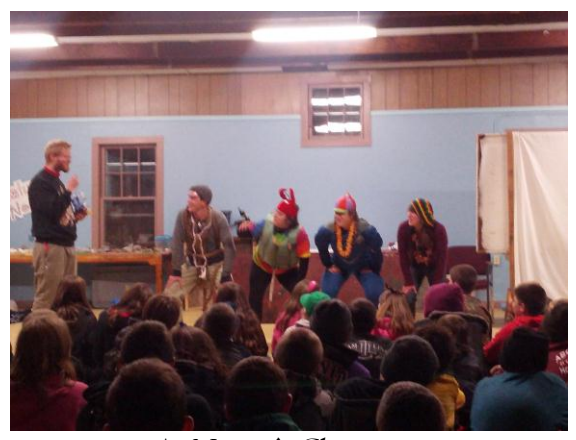
At Nature's Classroom