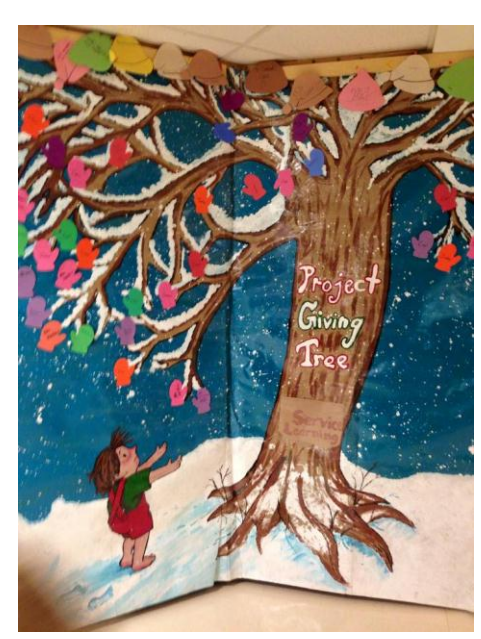
IHGMS Giving Tree Project