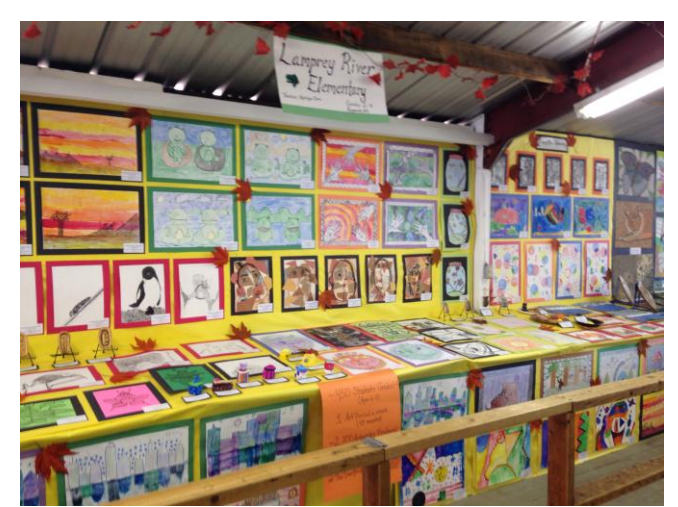
Student artwork at Deerfield Fair exhibit